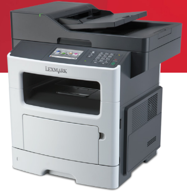
MX510de / MX511de/dhe