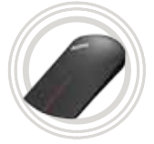
ThinkPad® X1 Wireless Touch Mouse

Wirelessly connect and expand the function of your device