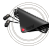
ThinkPad® X1 In Ear Headphones

Superior sound quality with a comfortable fit