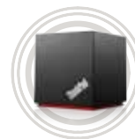
ThinkPad® WiGig Dock

Superior sound quality with a comfortable fit