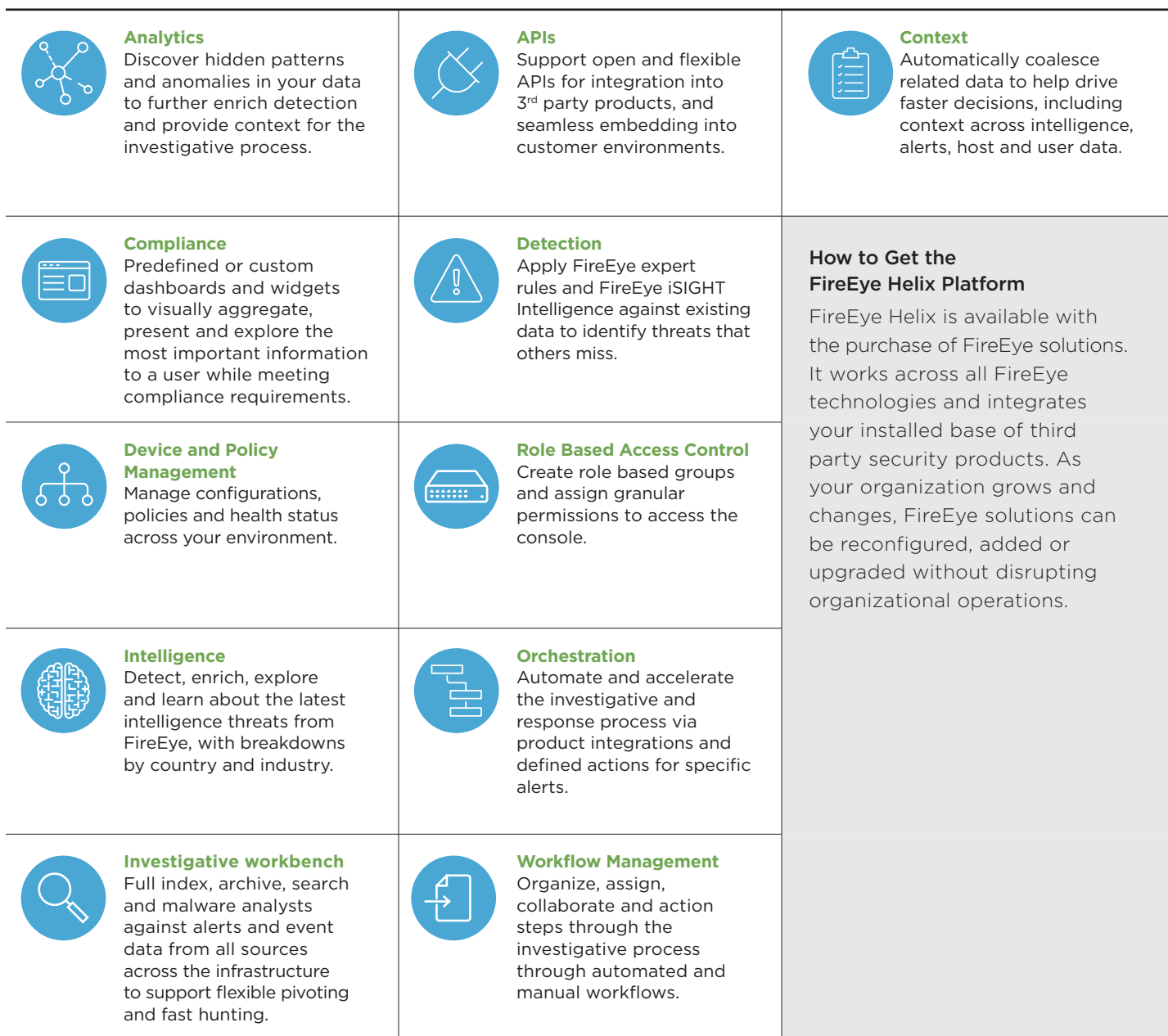
Figure 2. FireEye Helix features.

For more information on FireEye, visit: www.FireEye.com