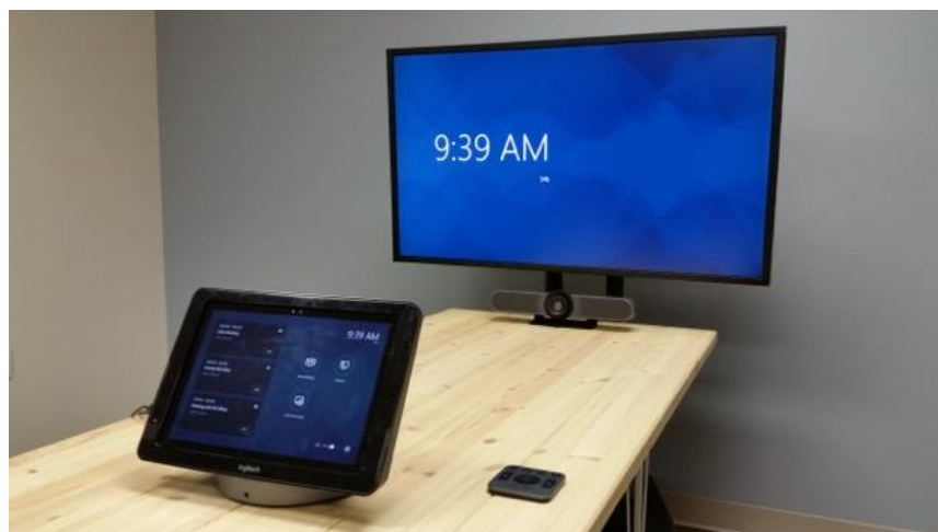
Skype for Business huddle room including Logitech MeetUp connected to Skype Room System (Surface Pro 4 tablet installed in a Logitech SmartDock)

Full Duplex Support – MeetUp passed our full duplex audio test (near and far-end participants speaking and hearing each other at the same time) without issue.