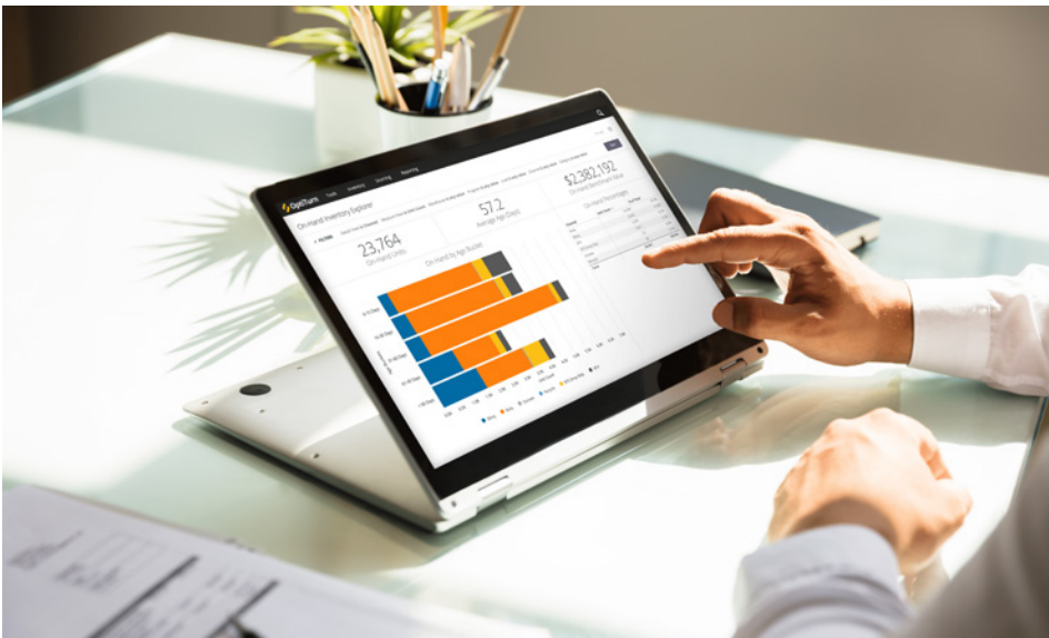
The returns optimization platform of Optoro, Honeywell's leading reverse logistics partner.

According to a Peerless Research Group (PRG) survey, 60% of retailers consider reverse logistics important to their companies. Yet only 32% have any formal corporate position or process for managing reverse logistics operations. 7