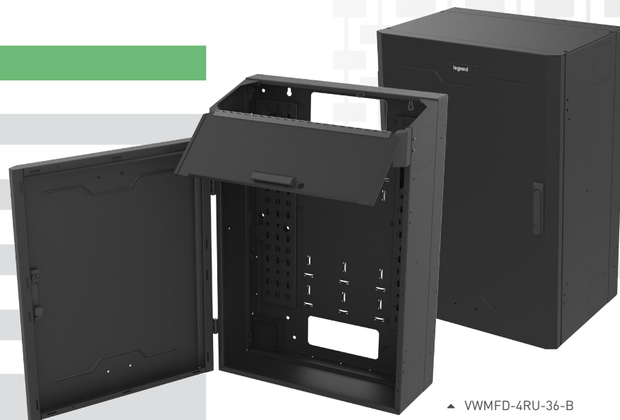
▲ VWMFD-4RU-36-B ◀ VWMSD-4RU-36-B