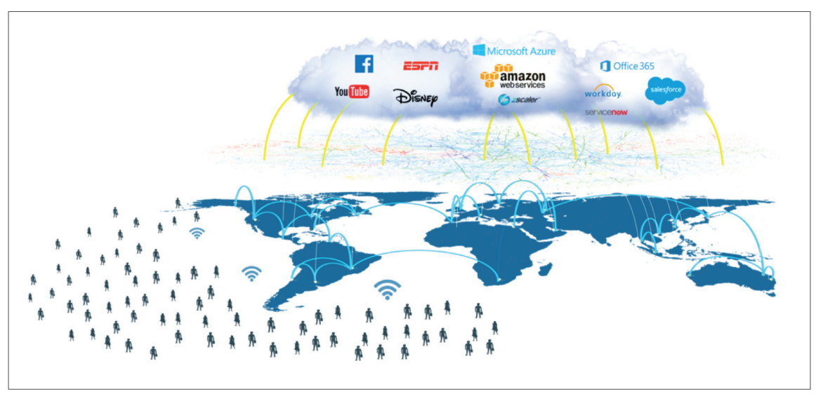
Figure 1 The new network reality. Most enterprise networks are out-of-date, brittle, and device-centric. IT teams are trying to manage global networks with tools designed for the way things were 15-20 years ago.